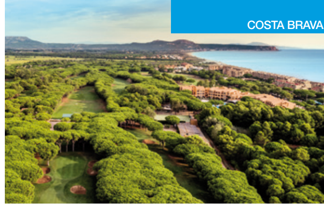
© JACOB SJÖMAN - GOLF DE PALS

Facilities include Hotel Terraverda, a 4-star hotel with 86 rooms and spectacular views of the course. Driving range with two tees and a practice bunker. A new Club House including a Golf Shop and Restaurant Entre-camps.