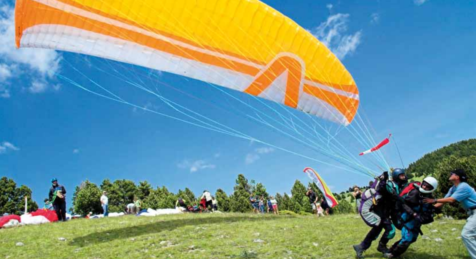
Paragliding in the Berguedà region (Pirineus)