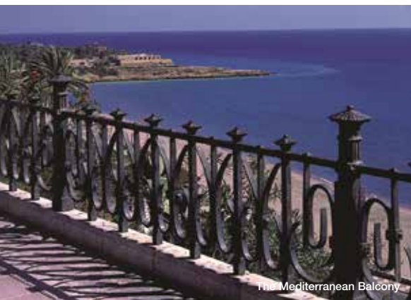
The Mediterranean Balcony