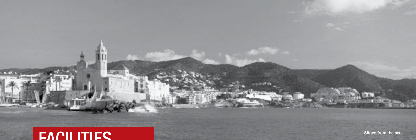
Sitges from the sea