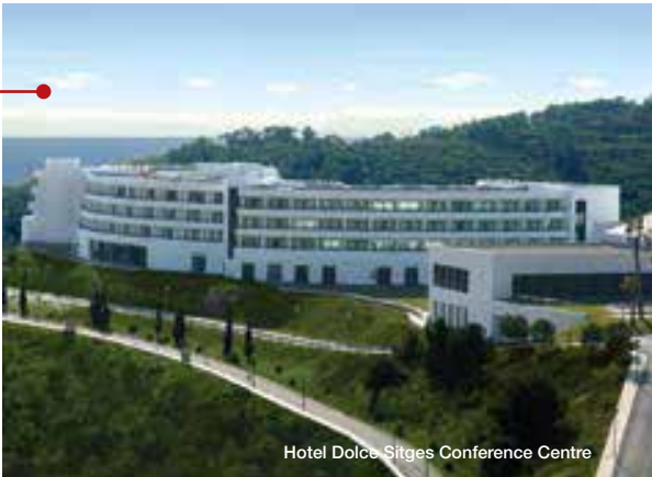
Hotel Dolce Sitges Conference Centre

CAPACITY OF THE LARGEST HOTEL: 307 rooms