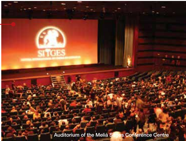
Auditorium of the Melià Sitges Conference Centre