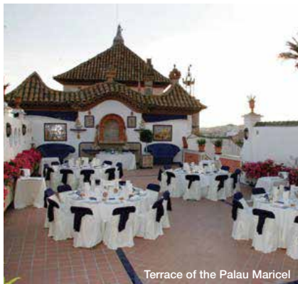
Terrace of the Palau Maricel

12 halls for 10 to 500 delegates and 27 sub-committee rooms