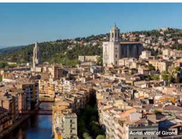
Aerial view of Girona