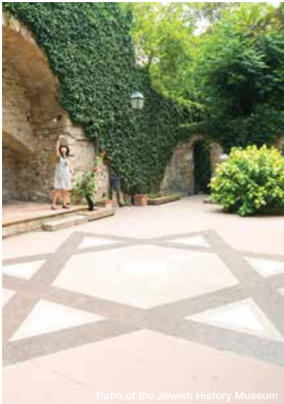
Patio of the Jewish History Museum