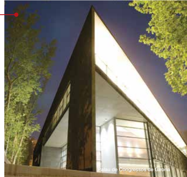
Palau de Congressos de Girona