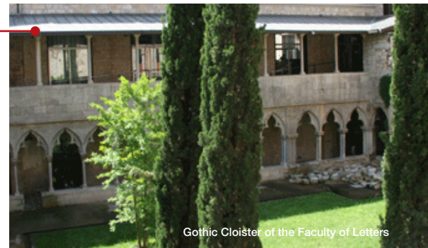
Gothic Cloister of the Faculty of Letters

CAPACITY OF THE LARGEST HOTEL: 115 rooms