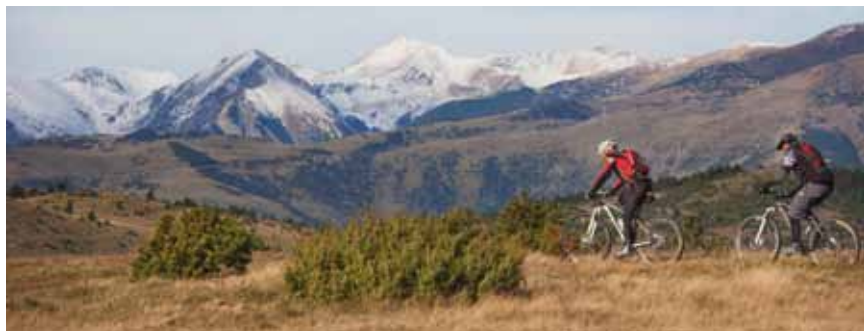
Mountain biking in Coll d'Ares, Ripollès-Vallespir.

In Girona, the Costa Brava blends into the mountains of Les Gavarres and the Pyrenees through charming routes beginning and ending in towns such as Calella de Palafrugell, Castell-Platja d'Aro, Sant Feliu de Guíxols, Lloret de Mar and Blanes. From the Maresme coast - with Malgrat de Mar, Santa Susanna and Calella as your starting points - a green belt of land connects five natural parks throughout the surrounding areas of Barcelona, taking you to symbolic sites such as Montseny, Montnegre and Montserrat. In the south, the Tarragona coastline is the gateway to the country roads of Montsant, Serra de Prades, and Ports de Tortosa-Beseit. From Cambrils, get to Mont-roig del Camp, Miami Platja and Sant Carles de la Ràpita.