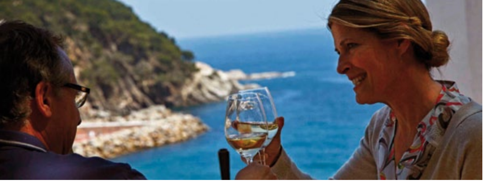
Wine, the coast, the Mediterranean. Three attractions of Catalonia in a single image